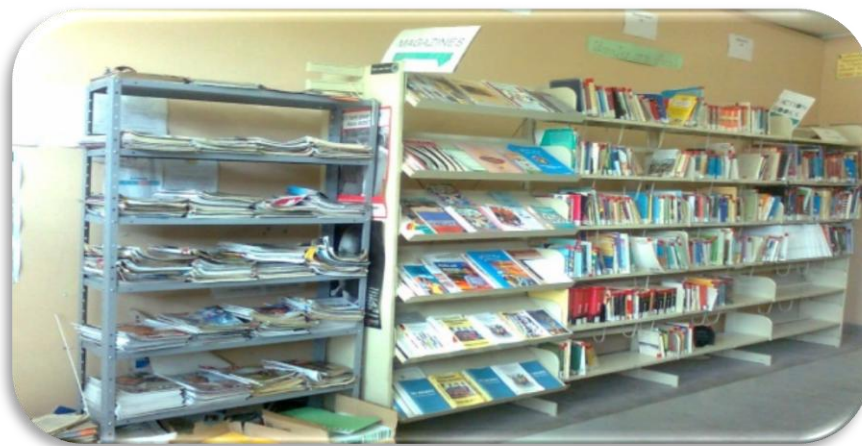
Fig 2: Language section of the school library (Newspapers, Magazines and Novels)

The research findings indicated that there are public libraries in the area i.e. the state library (regional library), the UNAM Northern Campus library and UNAM HP Campus library, but none of the teachers use the state library. The ones that use UNAM library are few that are doing part time study and they use it for their assignments. Most teachers do not read a lot except for daily newspapers and magazines.