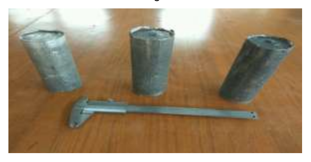
Figure 2 Casting samples

All process parameters were fixed at three levels within the above bounds to conduct experiments based on the L9(3)4 orthogonal array. The details of all parameters and their levels are given in Table 2. For each experimental condition, the casting samples were cast and are shown in Figure 2.