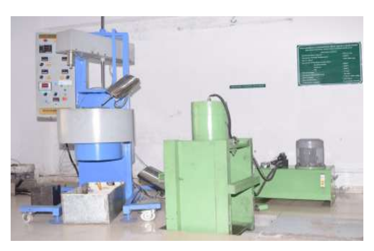
Figure 1 Experimental Setup